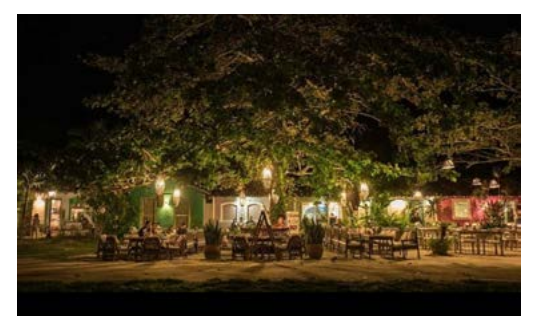
SILVANA & CIA

FOR A GENUINELY TRANCOSO EXPERIENCE, WITH MORE THAN 40 YEARS OF HISTORY IN THE QUADRADO, THIS RESTAURANT BELONGS TO ONE OF THE OLDEST NATIVE FAMILIES IN TRANCOSO. RECOGNIZED FOR EXCELLENCE IN MOQUECA AND TRADITIONAL BAHIAN DISHES, IT OFFERS AN AUTHENTIC ATMOSPHERE: DINING OUTDOORS UNDER AN ALMOND TREE, CONTEMPLATING THE CHURCH IN THE HISTORIC QUADRADO.